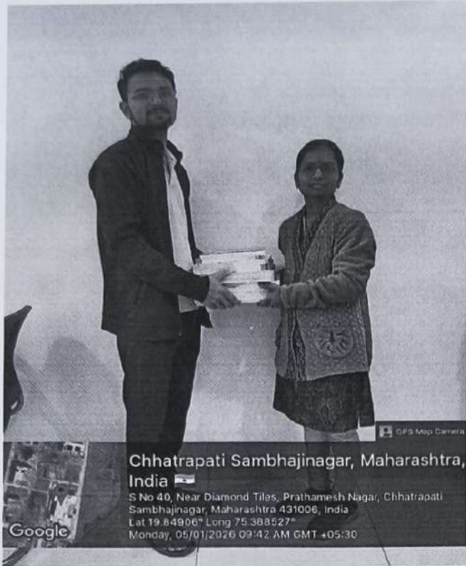
Chhatrapati Sambhajnagar, Maharashtra, India 🇮🇳 S No 40, Near Diamond Tiles, Prathamesh Nagar, Chhatrapati Sambhajnagar, Maharashtra 431006, India Lat 19.84906° Long 75.388527° Monday, 05/01/2026 09:42 AM GMT +05:30