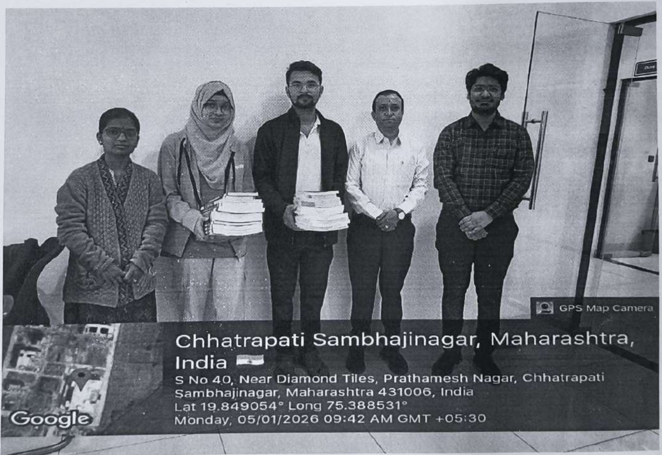
Chhatrapati Sambhajnagar, Maharashtra, India 🇮🇳 S No 40, Near Diamond Tiles, Prathamesh Nagar, Chhatrapati Sambhajnagar, Maharashtra 431006, India Lat 19.849054° Long 75.388531° Monday, 05/01/2026 09:42 AM GMT +05:30