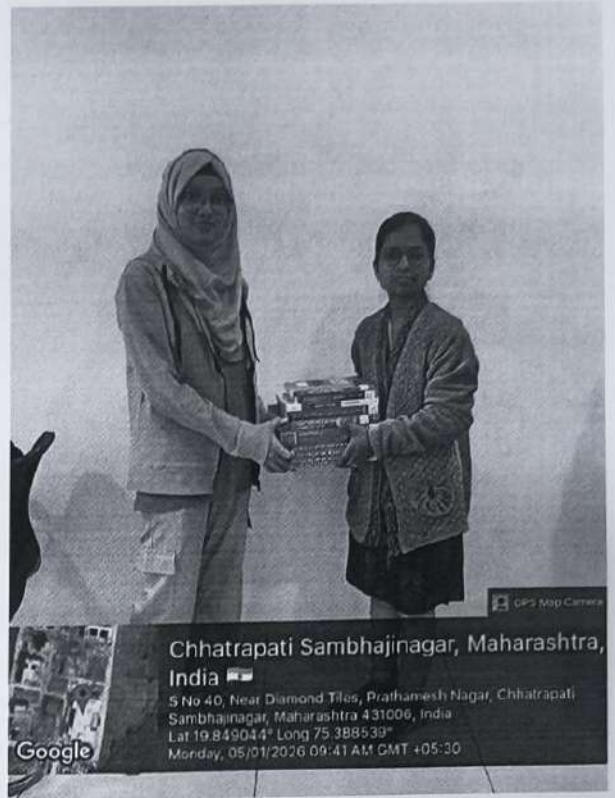
Chhatrapati Sambhajnagar, Maharashtra, India 🇮🇳 S No 40, Near Diamond Tiles, Prathamesh Nagar, Chhatrapati Sambhajnagar, Maharashtra 431006, India Lat 19.849044° Long 75.388539° Monday, 05/01/2026 09:41 AM GMT +05:30